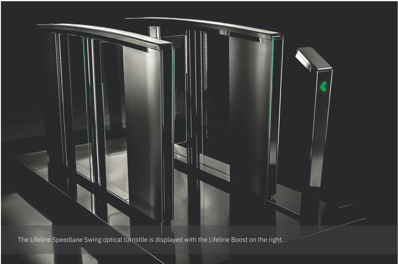
The Lifeline Speedlane Swing optical turnstile is displayed with the Lifeline Boost on the right.