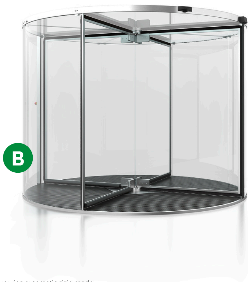
A: Four-wing power-assisted rigid model | B: Four-wing automatic rigid model