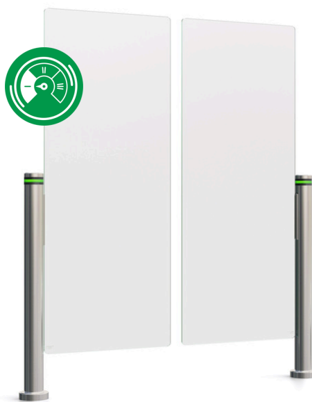
High glass with a double-wing