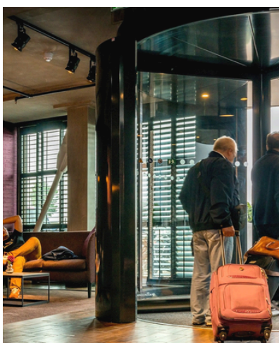
OmniVent V - Vertical Air Curtain