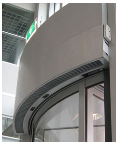
OmniVent C - Circular Air Curtain