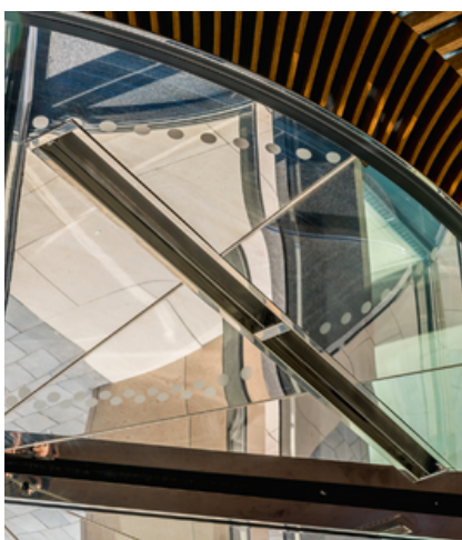
OmniVent I - Integrated Air Curtain

Our revolving doors come in different shapes and sizes, which is why we offer vertical and circular air curtains. Please contact a member of our Service Sales team to find out which air curtain is the best solution for your entrance system.